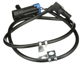
SU1370/ SKU:364561 GM (2002-97)

Duralast® ABS sensors delivered a more consistent signal output performance matching OE for output voltage, resistance, and all critical measurables.