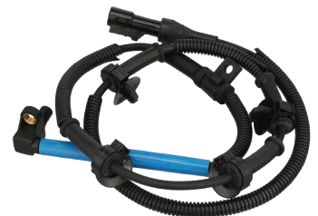
SU7601/ SKU:940428 Ford (2009-95)