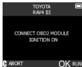
Turn on ignition