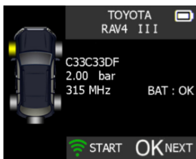
Use tool to read all sensor IDs