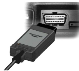
Connect tool to OBDII port