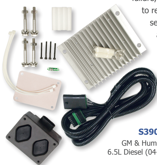
S39001 GM & Hummer 6.5L Diesel (04-94)