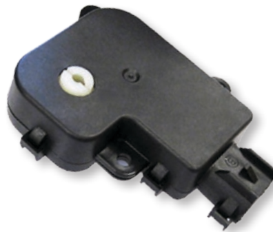
TechSmart® J04002 Exact Match